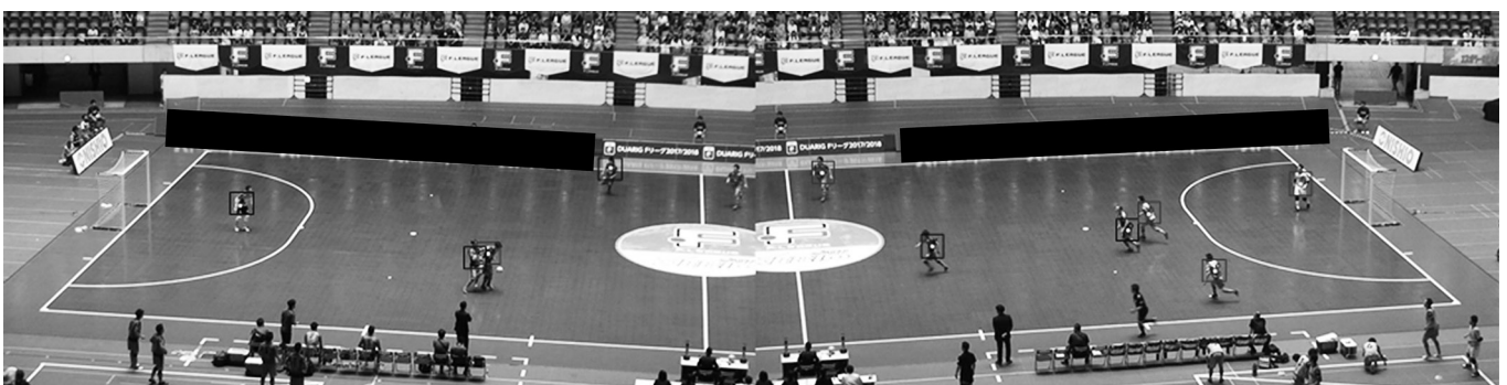
FIG. 1. Image processing.

Physical match performance was evaluated based on image processing using the semi-automatic tracking system [17]. The videos were recorded by two commercially available high-density cameras (HDR-CX560, SONY, Japan). The cameras were fixed on tripods, and the left and the right courts were captured with each camera. Figure 1 is a composite image of two images recorded by the automatic tracking system. The size of each image was 1920 \times 1080 pixels at a frame rate of 60 fps, and the videos were recorded in the progressive mode. The recording position was approximately 20 m away from the nearest touch line, and the height of the position was approximately 20–30 m from the court. The position information of the players was measured at a sampling interval of 1/20 seconds. In cases of tracking error due to overlapping of players in an image, the measured data of the target player were corrected by using a pen tablet (Intuos Draw CTL-490, Wacom, Japan). In this study, the automatic tracking rate was 82.4 \pm 3.7\% . The player's positions were determined by applying a 19-point moving average filter to the measured data. From the determined player position, the movement distances and velocities were calculated every 1/20 second. A player's speed was determined using a 5-point median filter. The measurement